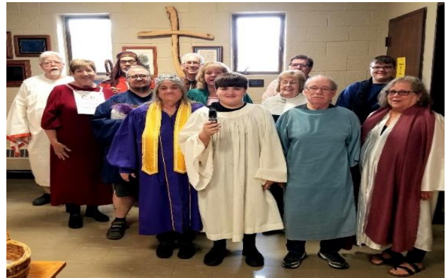
10:00 am Cast

The combined choir sang at both services, and the Fishing Club shared four songs with the congregation at the second service.