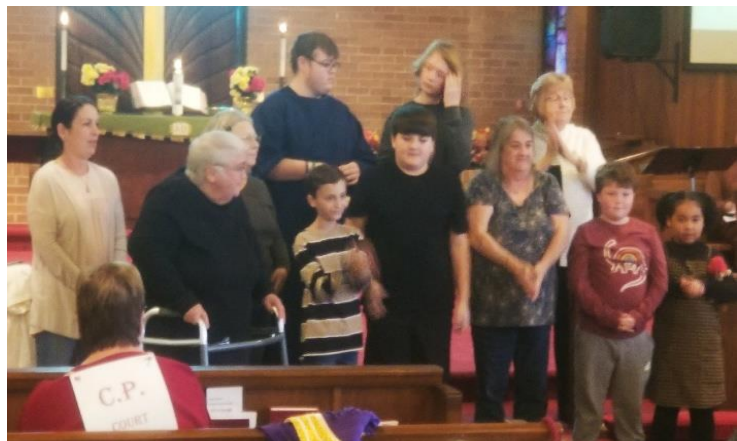
Fishing Club at Laity Sunday

It was a day of celebration, but also a day to remind us of the many different ways in which we are called to serve our Lord!