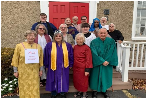
8:30 am Cast