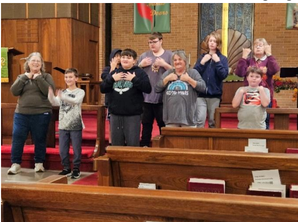
Fishing Club Rehearsal

The combined choir sang at both services, and the Fishing Club shared four songs with the congregation at the second service.